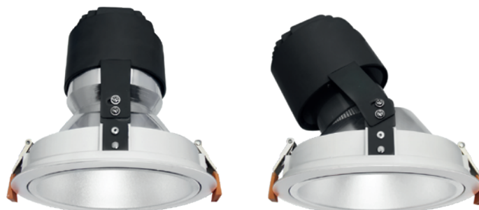
ND181, ND183 ND185, ND187